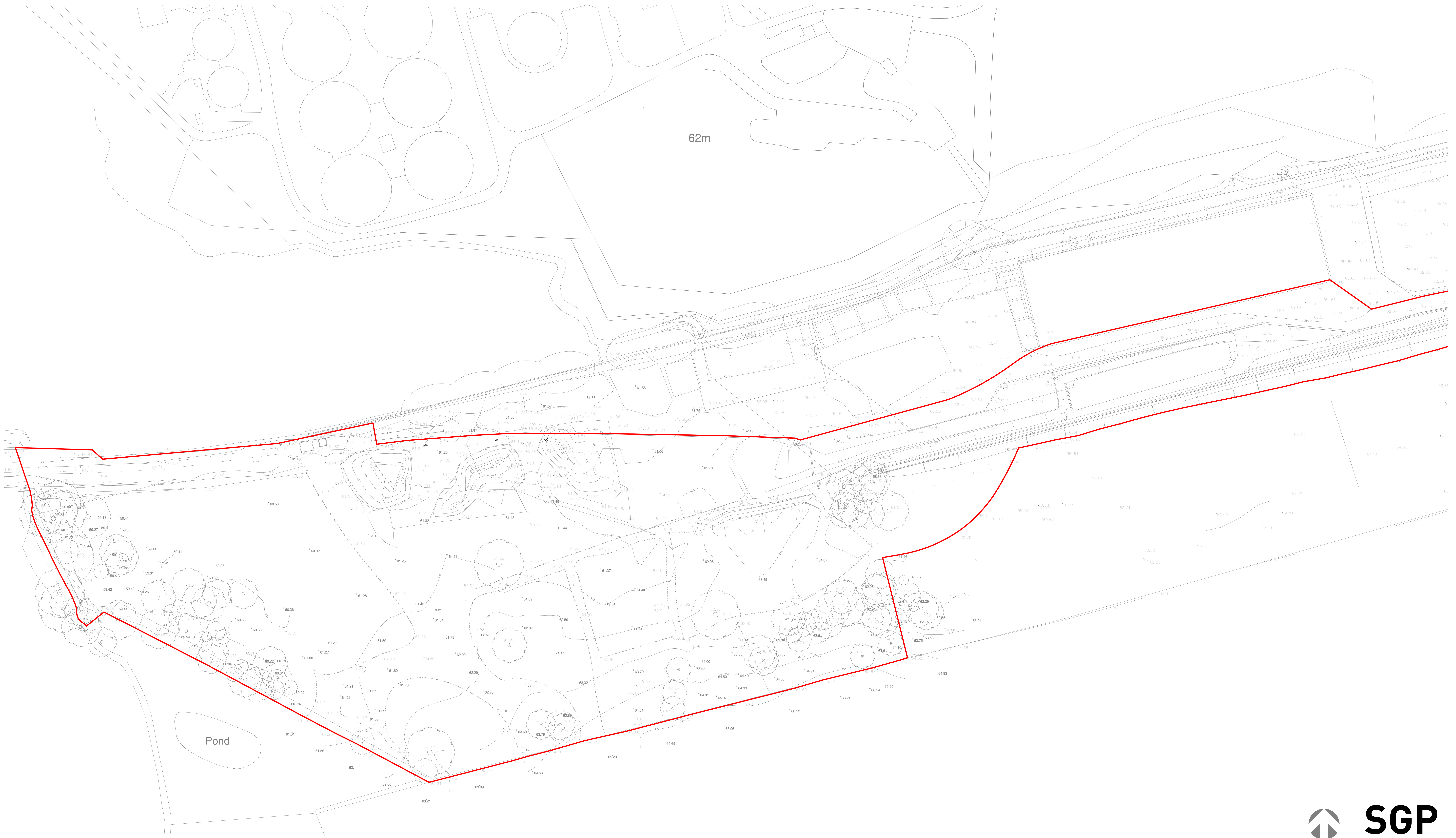
1 Topo Site Plan 1 : 500